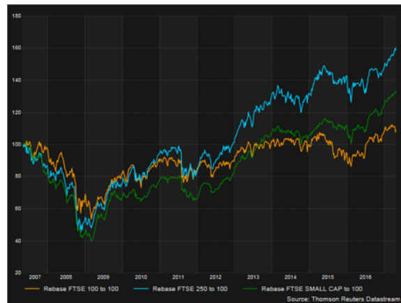
Small-cap, mid-cap and large-cap 10-year returns