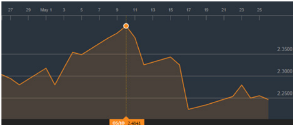
S&P 500 Index